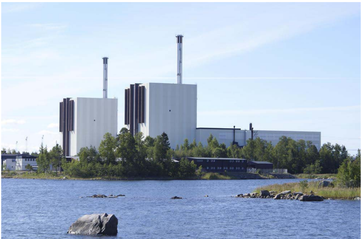
Forsmark 1 and 2 are beautifully situated by the Uppland coast.

The Environmental Court grants Forsmark permission to increase power at all three reactors.