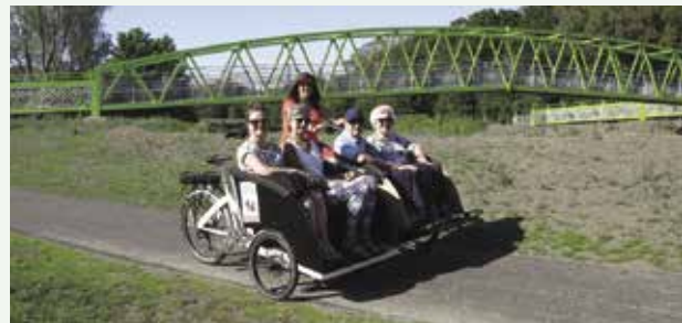
Image: One of the many projects featured in the Inform and Inspire sessions discussed how community benefit is helping improve access to the River Carron and helping elderly and less mobile residents enjoy the outdoors.

The Working Group consists of representatives of key local organisations, including community councils and development trusts, and is meeting every couple of months. Upcoming sessions will focus on a review of community action plans, respective community benefit funds' with 'Upcoming sessions will focus on local priorities for each of the four South Kyle communities individually and a participatory budgeting project where local young people can practice decision-making by choosing how to spend a small amount of money donated by Vattenfall.'