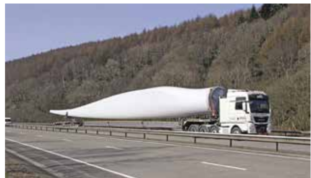
Pen y Cymoedd Wind Farm

Work has also been progressing to connect the northern and southern sections of South Kyle Wind Farm. New tracks have been laid and a new temporary bridge installed over the Prickeny Burn, meaning plant and people can now move across site without detouring via the A713 and B741.