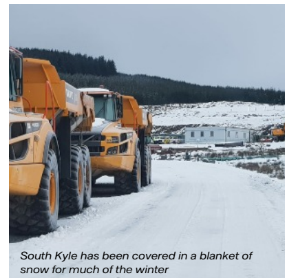
South Kyle has been covered in a blanket of snow for much of the winter

Meanwhile, access work continues, clearing the way for drivers, groundsmen, engineers and technicians, and contributing to South Kyle being one of the biggest timber resources in the UK throughout 2020/21. Their work will also help enable delivery of the habitat management plan and woodland replanting.