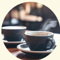
Free entry and refreshments