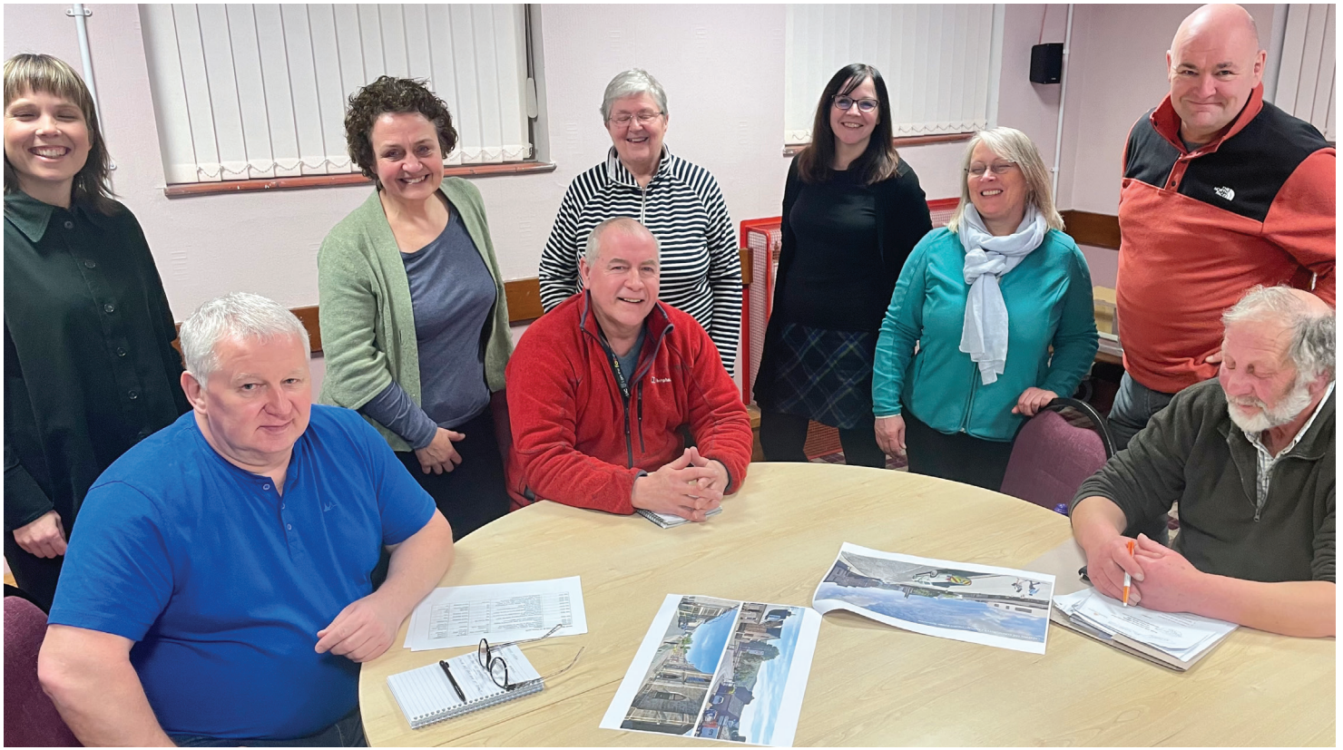
South Kyle Community Benefit Fund Working Group