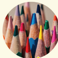
Crafts · Assaults Course Inflatables · Indoor Soft Play