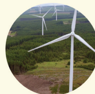
PLUS free shuttle bus tours from the Fun Day to South Kyle Wind Farm*

For more information please visit www.vattenfall.co.uk/southkyle