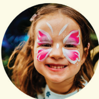
Face-painting · Bouncy Castle · Stalls-Bubble Football · Climbing Tower