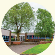
Doon Academy Dalmellington

Saturday 24th June, @ Doon Academy, Dalmellington, 11am to 3pm - all welcome