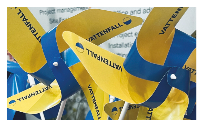
Thank you to all the young people, parents, teachers and staff who came to see us at the very busy Pathways to Careers Event

Thank you to the 100 plus children, young people and staff who've welcomed us into their schools over the past two months to highlight careers in the onshore wind industry and its extensive supply chain. We've been all over East Ayrshire from Fenwick Primary and Park School to St Xaviers Primary, Doon Academy and Robert Burns Academy, as well as attending the excellent Pathways to Careers fair last month.