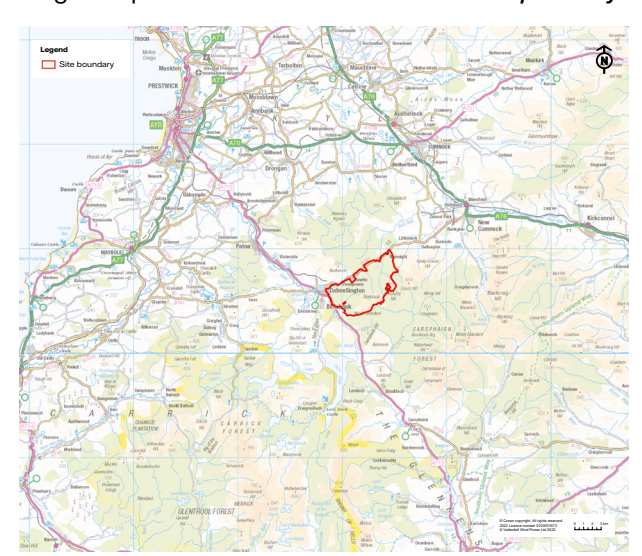
The red line boundary on the map above indicates the location of the site.