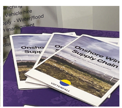
From left: New dishwasher for YMCA in East Ayrshire, Carsphairn's Bairns Banter Easter Egg hunt, Supply chain event.